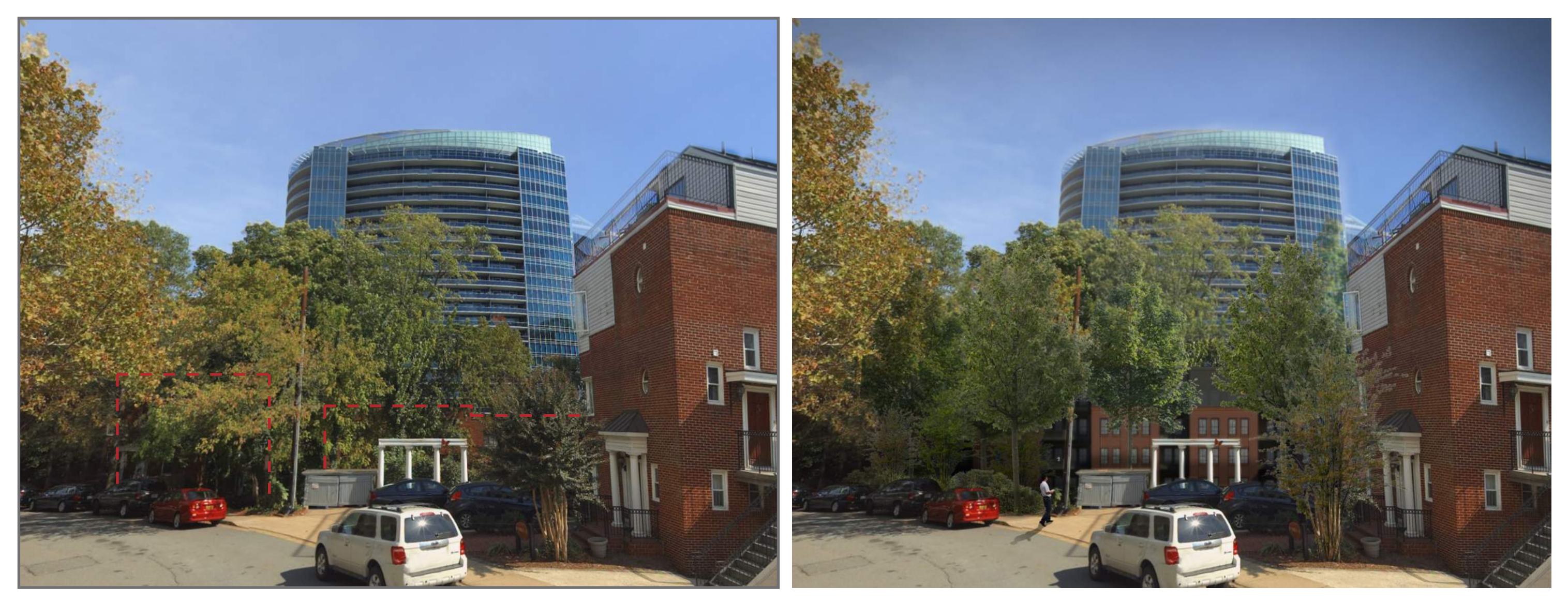
Existing View from North Colonial Terrace