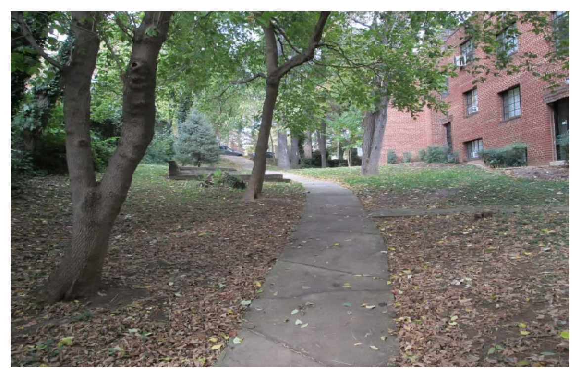
EXISTING PATH--VIEW UP TOWARD COLONIAL TERRACE