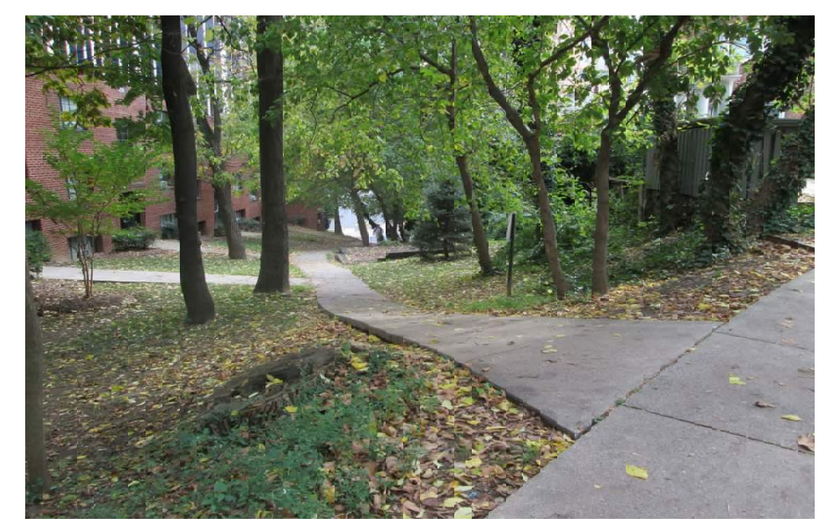
EXISTING PATH--VIEW DOWN FROM COLONIAL TERRACE