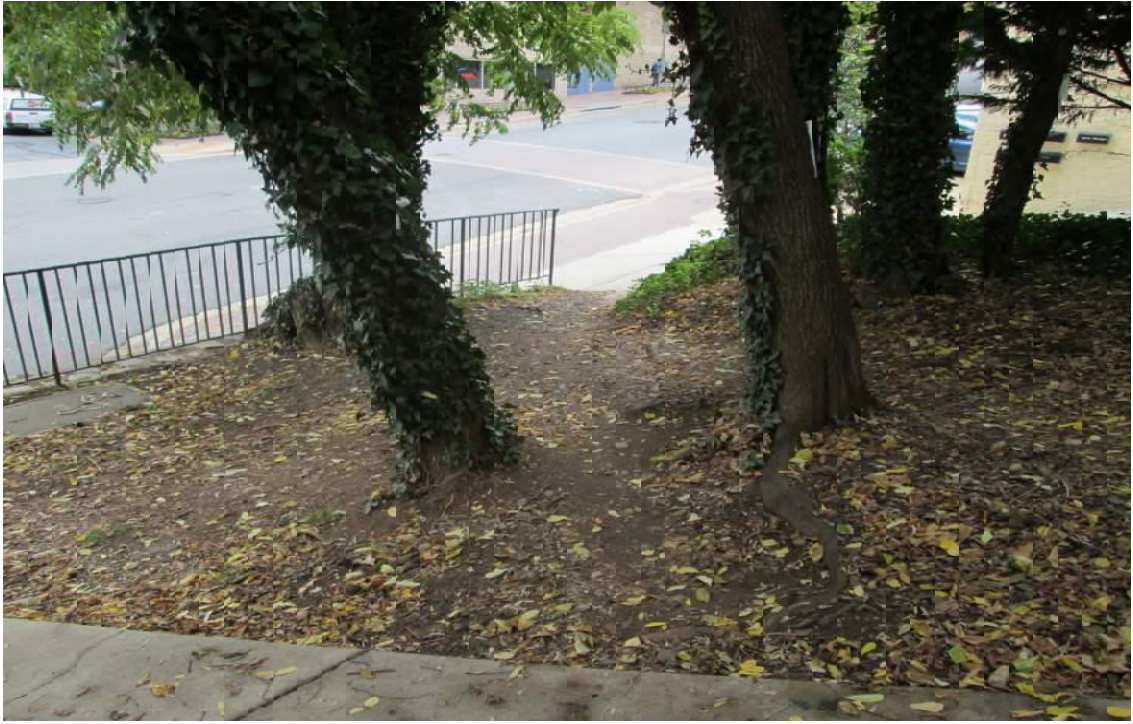
BOTTOM OF PATH - VIEW TO WEST