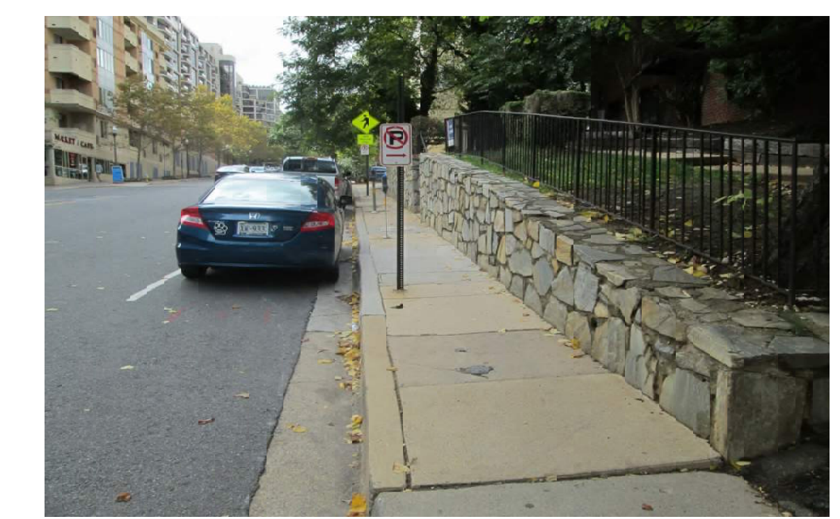
KEY BLVD FRONTAGE - VIEW UP-HILL TO WEST