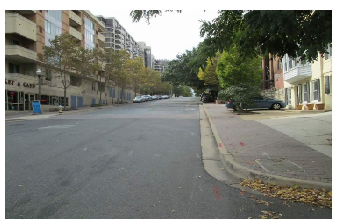
WESTERN PROPERTY BOUNDARY ON KEY BLVD - VIEW UP-HILL TO WEST