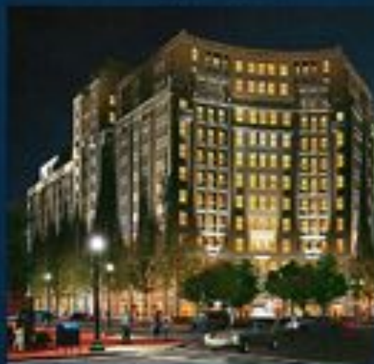
Lyon Place Apartments Clarendon