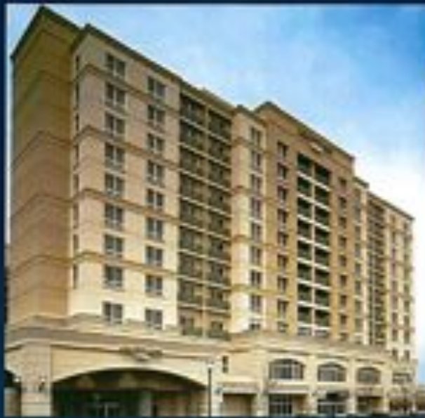
Courtyard by Marriott Tysons Corner