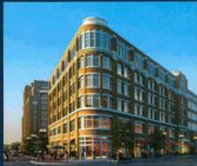
Clarendon Center North Clarendon

B. F. SAUL COMPANY 1700 Lee Highway Redevelopment Concept