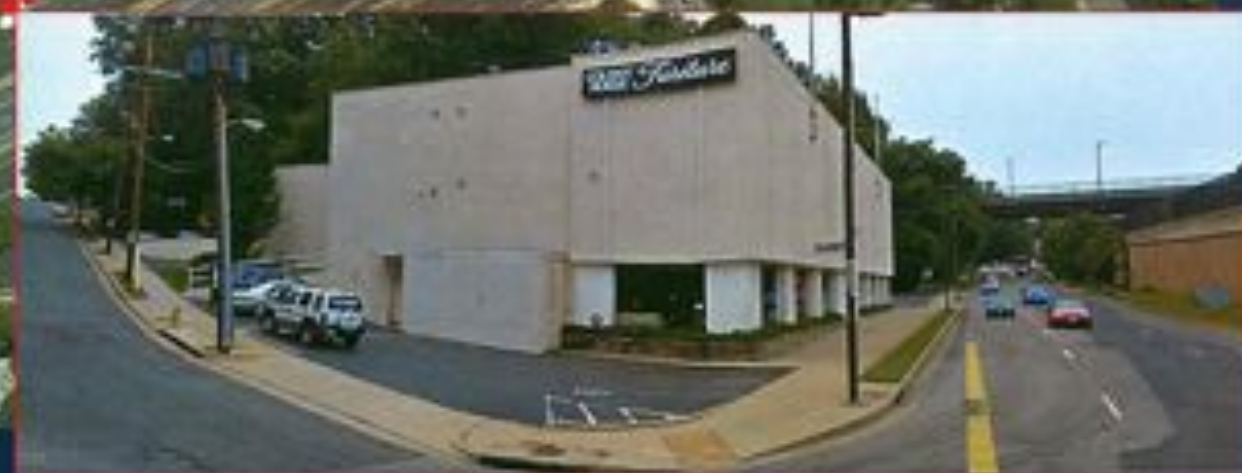
B. F. SAUL COMPANY 1700 Lee Highway Redevelopment Concept