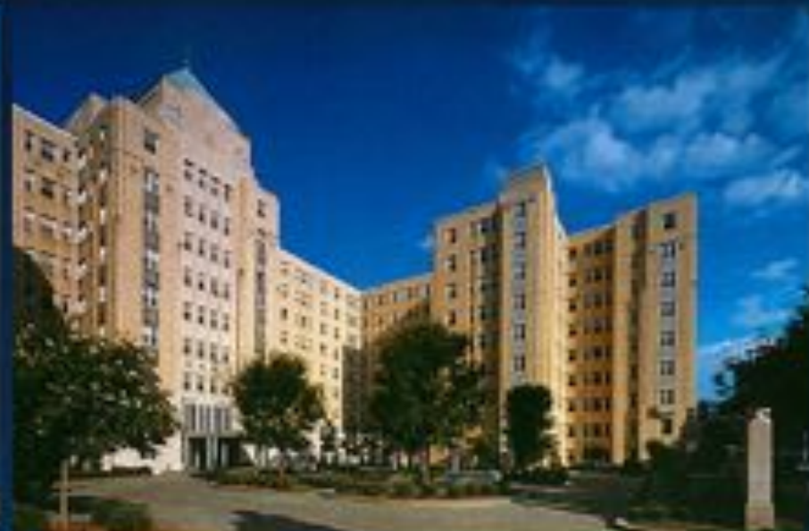
The Kennedy-Warren Washington, DC