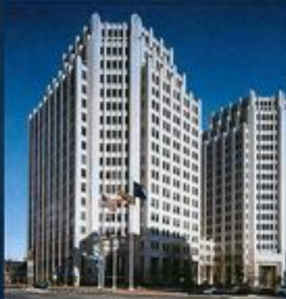
7501 Wisconsin Avenue Bethesda