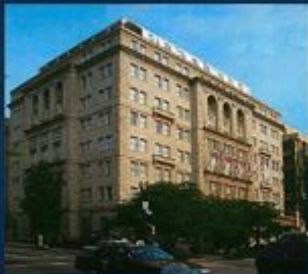
The Hay-Adams Washington, DC