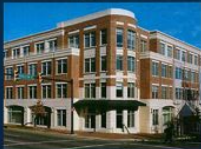
Washington Square Alexandria

B. F. SAUL COMPANY 1700 Lee Highway Redevelopment Concept